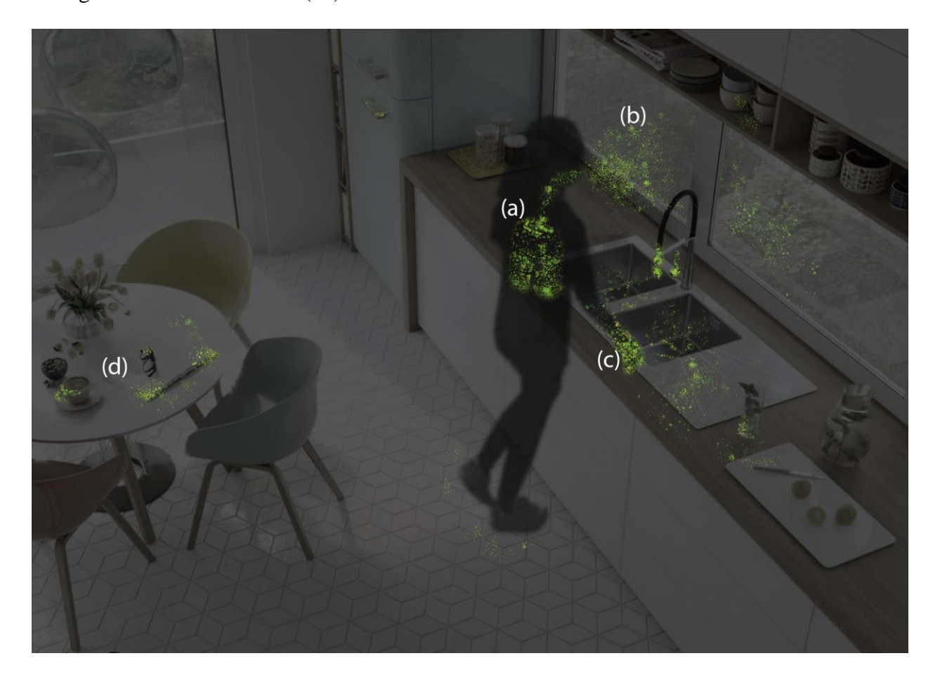
Figure 2: Conceptualization of SARS-CoV-2 deposition. (a) Once infected with SARS-CoV-2, viral particles accumulate in the lungs and upper respiratory tract (b) droplets and aerosolized viral particles are expelled from the body through daily activities such as coughing, sneezing, talking, and non-routine events such as vomiting, and can spread to nearby surroundings and individuals (35, 41) (c) Viral particles, excreted from the mouth and nose, are often found on the hands and (d) can be spread to commonly touched items such as computers, glasses, faucets, and countertops. There are currently no confirmed cases of fomite-to-human transmission, but viral particles have been found on abiotic BE surfaces (35, 40, 43).

abundance of caution, it is important to consider the possibility that the virus is transmitted through aerosols and surfaces (46).